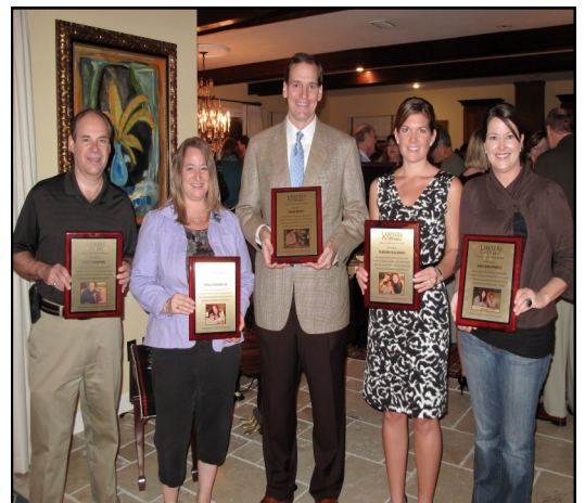
TUTORS HONORED at the Fall Kick-off reception for five years of service tutoring children.

I am really enjoying working with my student partner. She is great!