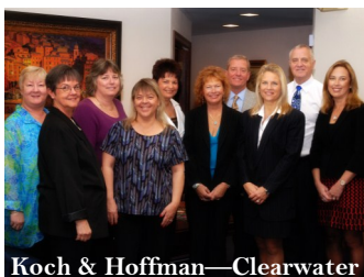
Koch & Hoffman—Clearwater

The Koch & Hoffman firm of Clearwater has jumped in this year with nine tutors serving at Sandy Lane Elementary in Clearwater.