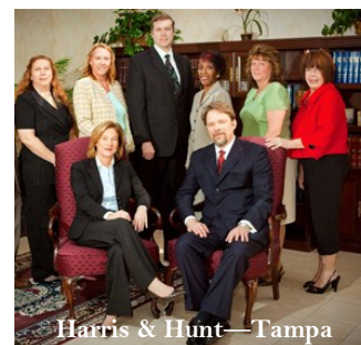
Harris & Hunt—Tampa

"Not only did the project increase the strength and cohesiveness of our staff, but gave each of us the opportunity to make a